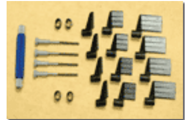
PMK2 (Drywall mounting tabs)

**Specifications are subject to change without notice.