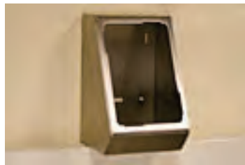
SSMK-2 (ADA Compliant)