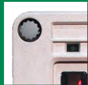
Temper proof mounting