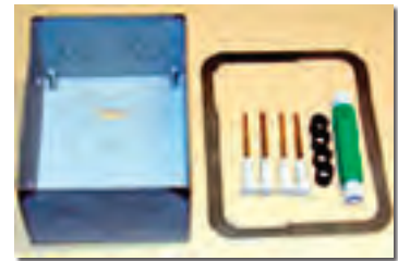
SPMK-2 (Back box with gasket)